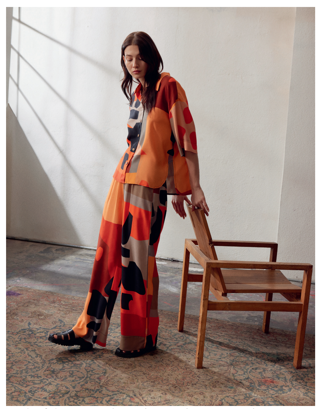
A playful spin on the richness that apricot hues typically possesses, orange is making a comeback through next spring and summer.